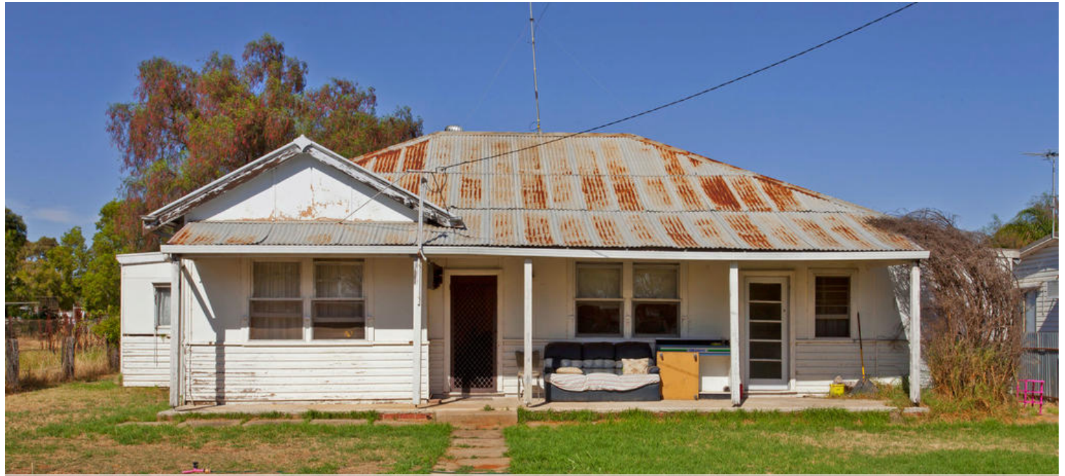
24 Belah Street, Rand