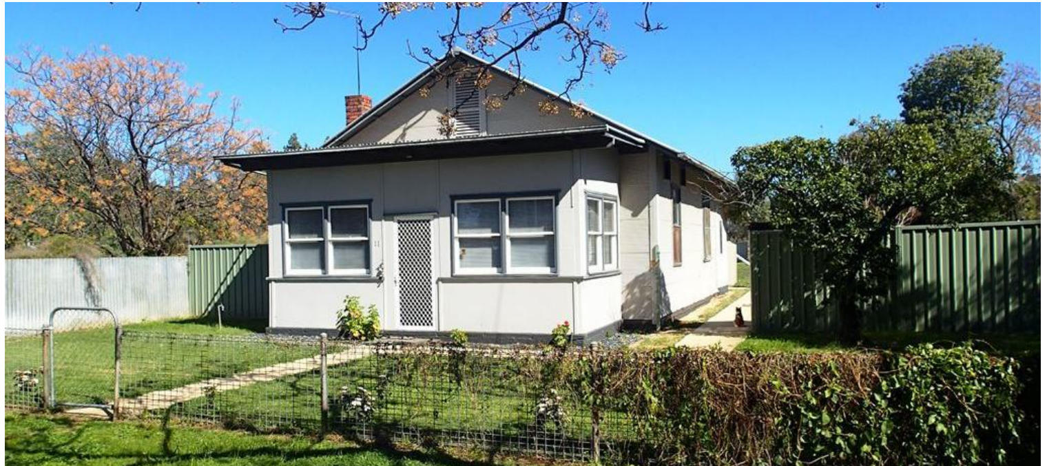
11 Murray St, Oaklands