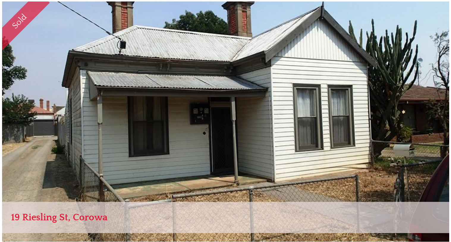
19 Riesling St, Corowa