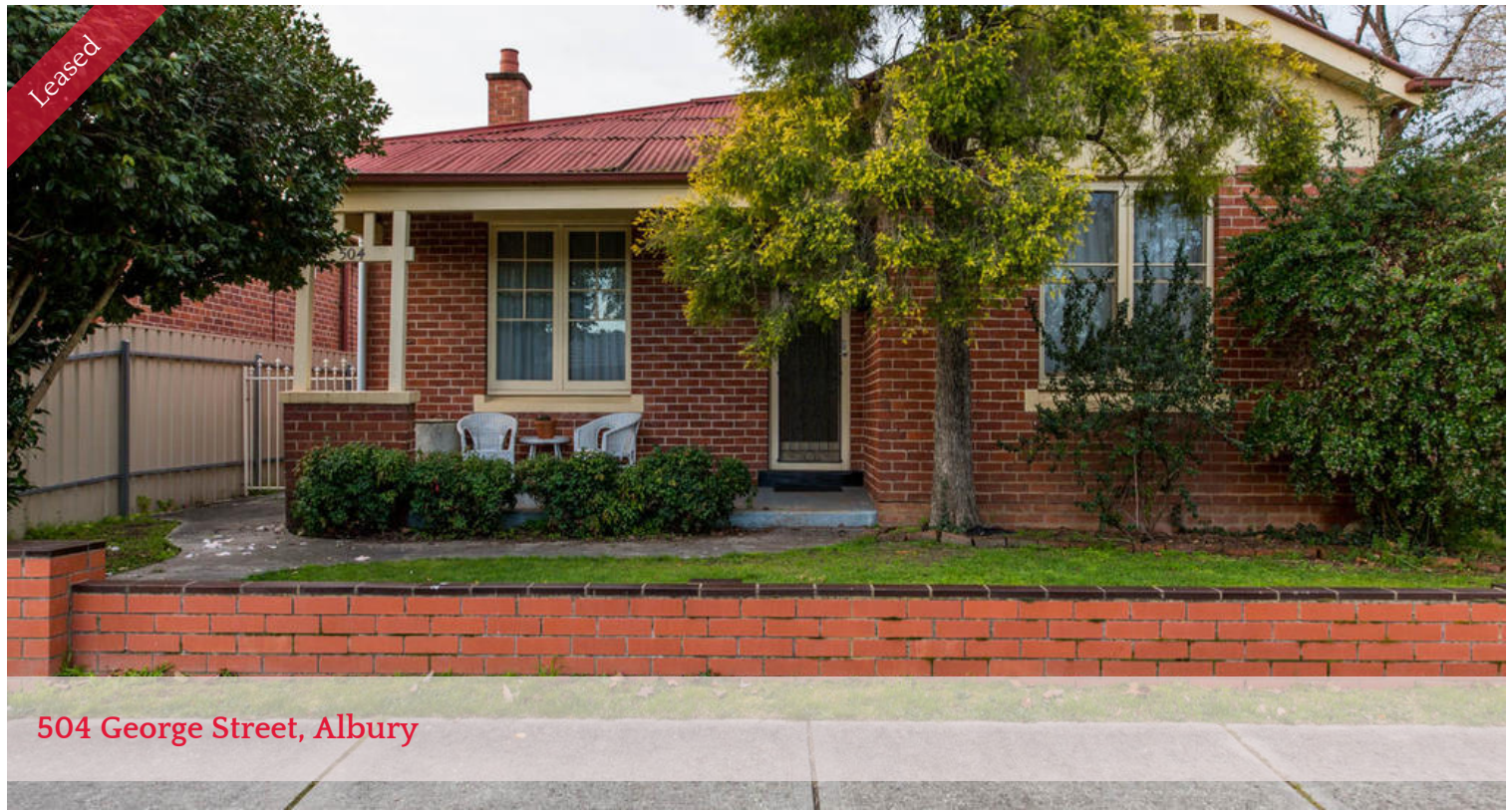
504 George Street, Albury