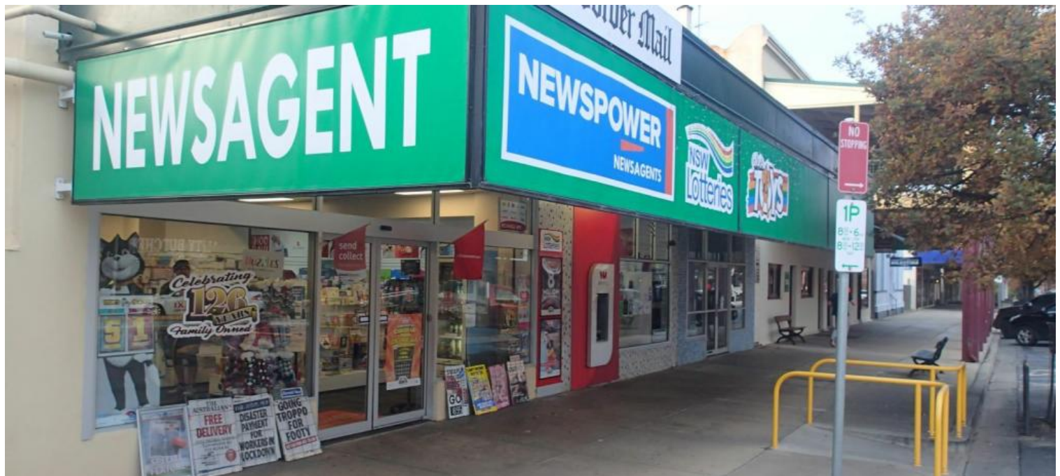
65 Sanger St, Corowa