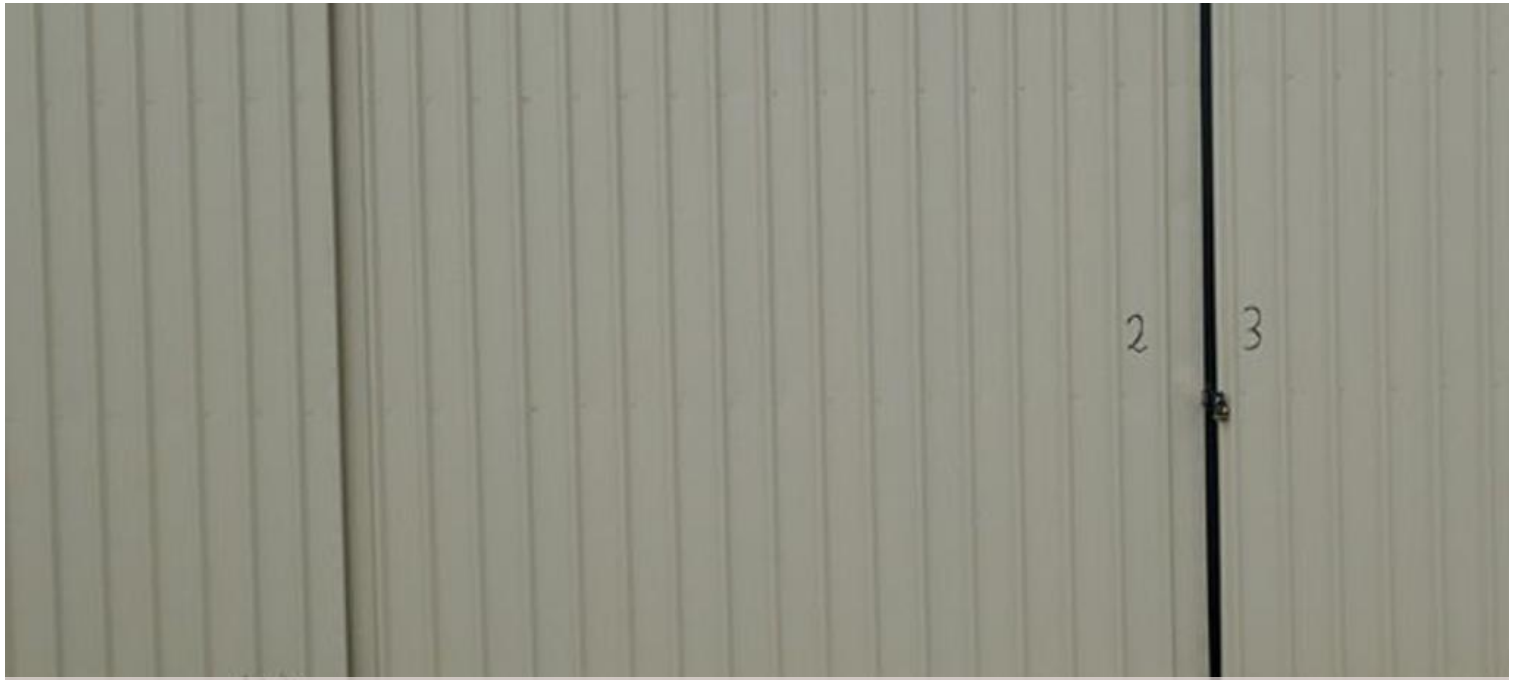
Shed 3, 12-14 Headerworld Avenue, Corowa