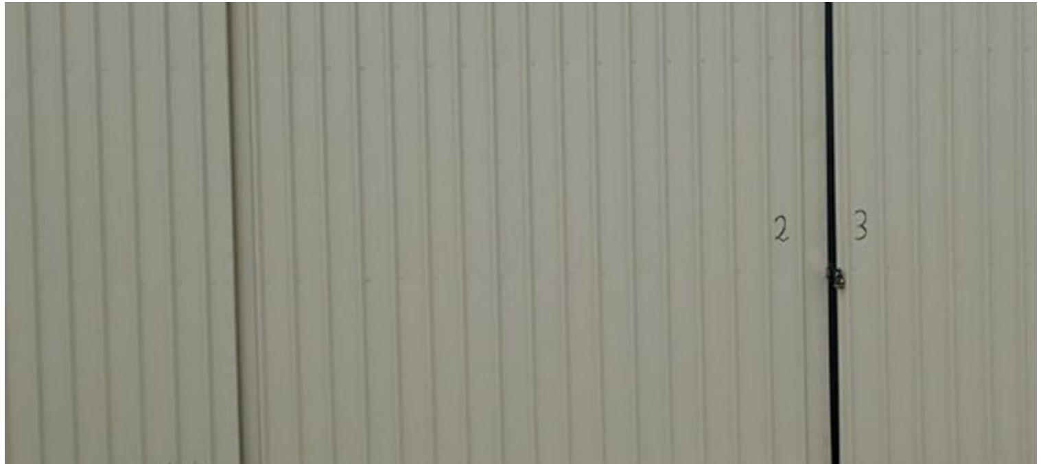
Shed 3, 12-14 Headerworld Avenue, Corowa